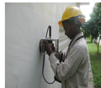
Monitoring Tilt Plate