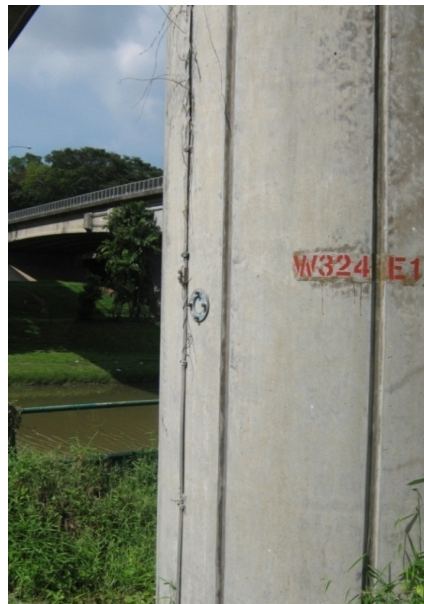
Tiltplate installed on a MRT column