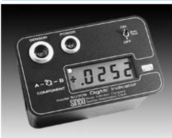
Tilt Plate Monitoring