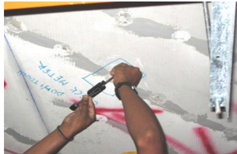
Crack Meter Installation